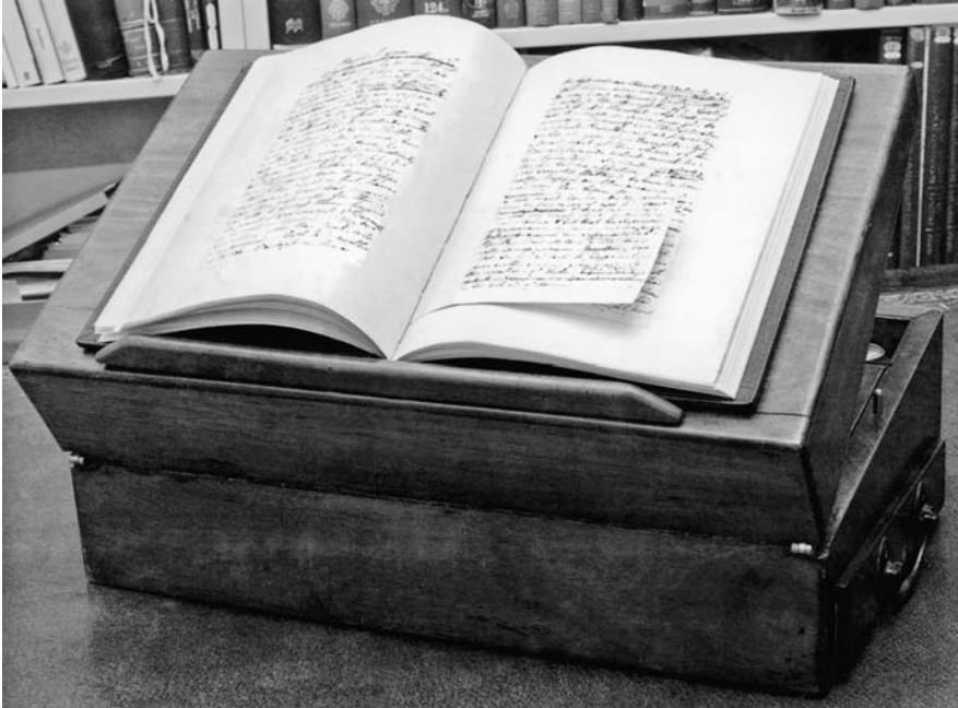
Jane Austen's writing desk, a cherished private heritage that is now a public treasure.

Library, was purchased by Jane Austen's father, the Reverend George Austen, from Ring Brothers at Basingstoke in December 1794, in time for Jane Austen's birthday or her twentieth Christmas at Steventon. It was at Steventon Rectory that the foundations of Jane Austen's later fame were laid. There, in 1796, she began the first draft of a novel, completing it in just ten months. "[M]y own darling child" was later "lopt & cropt" at Chawton (29 January 1813) and published in 1813 as Pride and Prejudice .