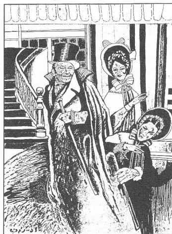
A Hebrew Pride and Prejudice published by Maariv Book Guild, Tel Aviv, 1984.

translatable by different words. In German, the word “Stolz” emphasizes the negative meaning carrying with it the sense of arrogance. Thus, the meaning of the words take on a different colouring in different languages.